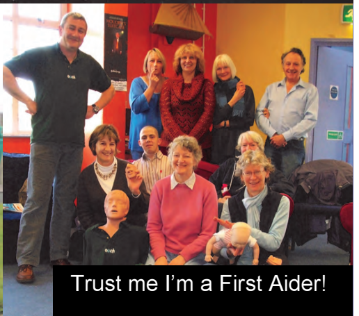
Trust me I'm a First Aider!