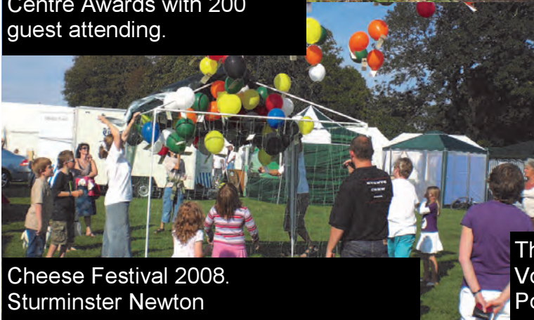
Cheese Festival 2008. Sturminster Newton