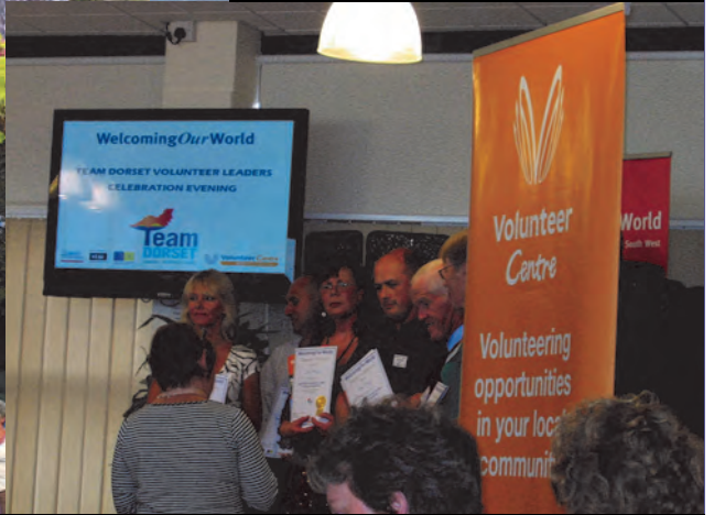
The Centre Co-Hosting WOW 2012 Volunteers Leaders event at Weymouth & Portland Sailing Academy