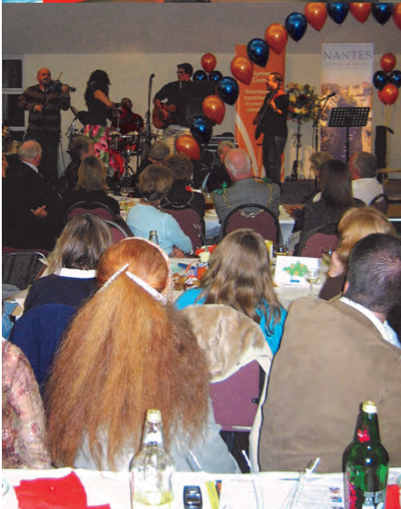
Huge success at Volunteer Centre Awards with 200 guest attending.