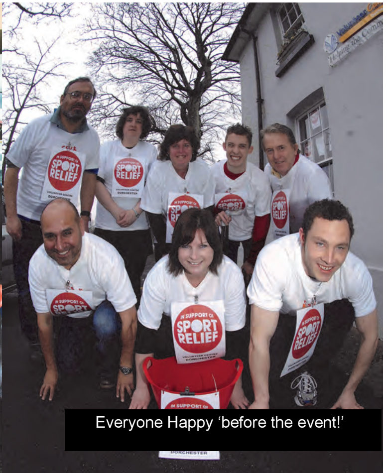
Everyone Happy 'before the event!'