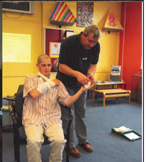
First Aid at Bridport